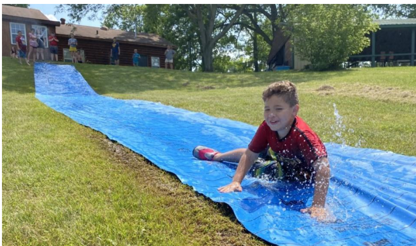
Enjoying a hot summer day at camp!