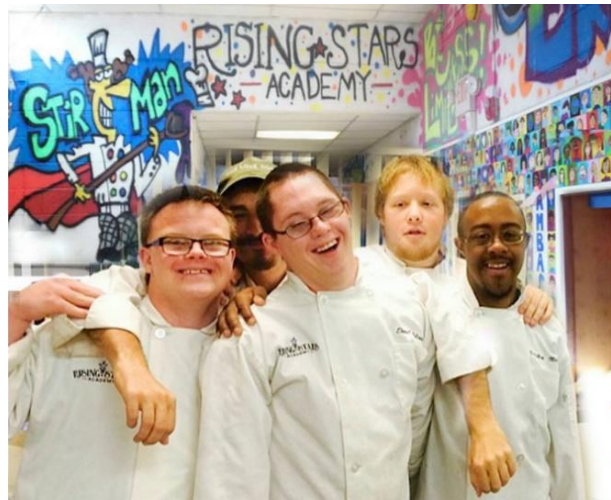
Developing Skills in the Community